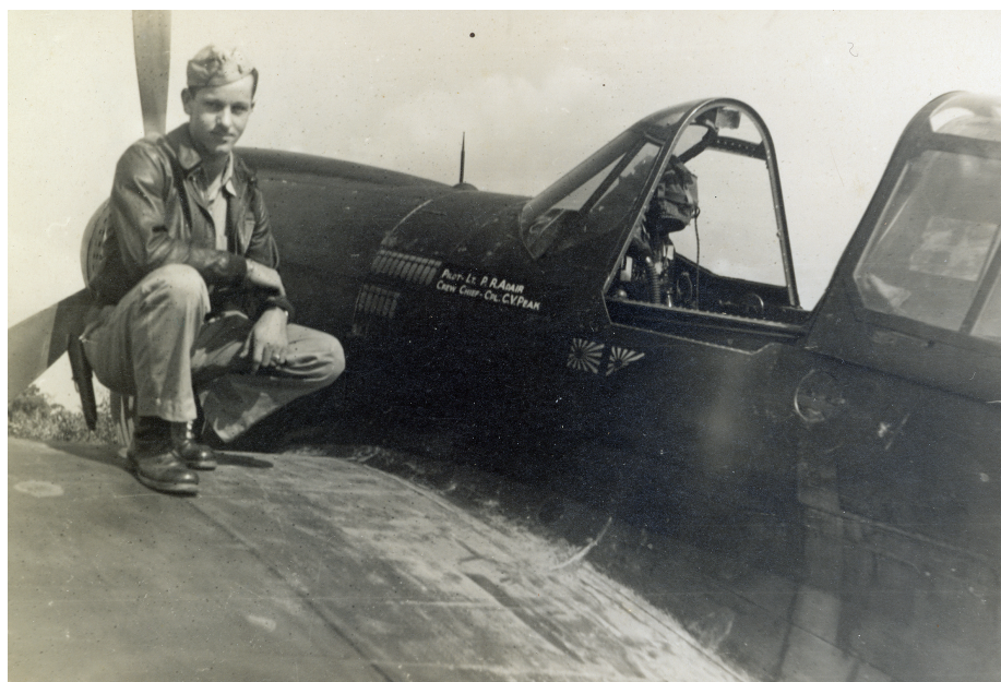
Me and Lulu Belle after the first encounter with the Japs

the elevator trim crank, and started cranking. It turned freely, with no effect, so yanking back on the throttle, and with both hands on the stick, was finally able to get the nose out of the jungle, and up into the sky. With a big sigh of relief, and thanking God for watching over my shoulder, pointed Lulubelle for home, about 125 miles away.