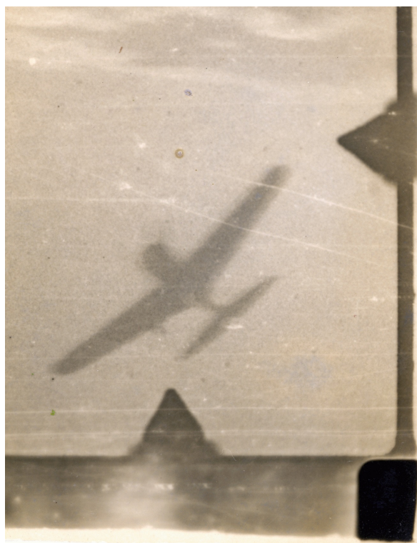
A third Zero damaged and the landing gear dropping was not confirmed

Well into a high speed dive by this time, I just held it there until the ground was coming up pretty fast. When I tried to pullout, the response to stick pressure was very sluggish, and remembering that full nose down trim had been applied, I grabbed