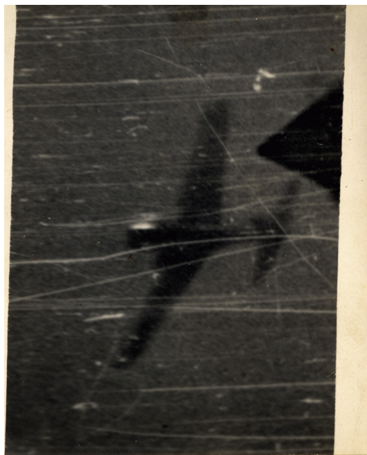
This Zero's engine caught fire but was not confirmed. Listed as probable

As soon as I could see that I was not being followed, I climbed back on top, and behind the formation again. I don't