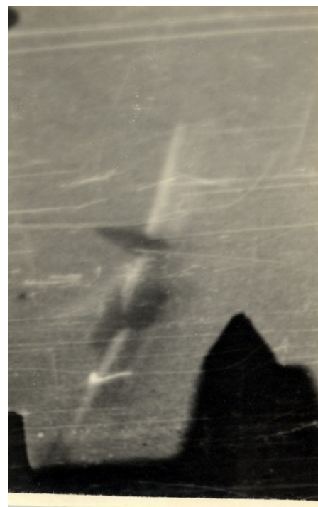
This Bomber was confirmed shot down but was claimed by May